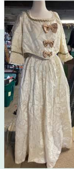
[1] wardrobe suit