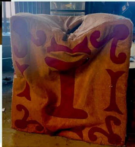
[2] alphabet blocks